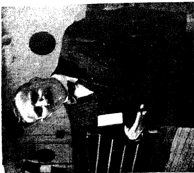
STEFAN ZWEIG ON S. S. URUGUAY, ON HIS LAST VOYAGE TO BRAZIL, AUGUST, 1941